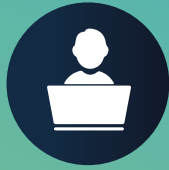
Audit Assistant - Junior